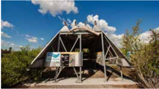
Chino Creek Wetlands and Educational Park (CCP)

Located in the city of Chino, the Chino Creek Wetlands and Educational Park (CCP) provides a hands-on opportunity for the community to experience the importance of constructed wetlands in the protection of our watershed. CCP helps improve water quality, flood control, habitat restoration, water conservation, and provides recreational opportunities for the public. CCP highlights the history of the Chino Valley and the importance of water in our region's economic development with stylized graphs of the hydrologic water cycle, the importance of saving water and public education on how to use water wisely.