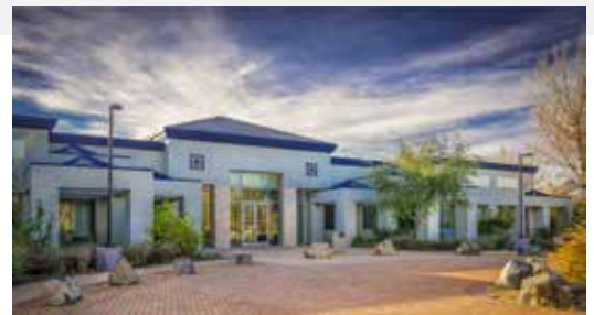
— Administrative Headquarters —

Located in the city of Chino, IEUA is the first public agency in the nation to receive the Platinum rating from the U.S. Green Building Council's Leadership in Energy and Environmental Design (LEED™). Finalized in 2003, IEUA's administrative headquarters takes water and energy conservation to new levels. The extensive use of recycled materials is seen throughout the interior and exterior of the headquarters complex.