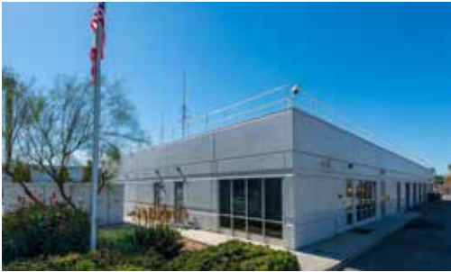
Chino Basin 1 Desalter

The Chino Basin Desalter Authority (CDA) was formed under a Joint Exercise of Powers Agreement by local agencies, including: cities of Chino, Chino Hills, Norco, and Ontario, IEUA, Jurupa Community Services District, Santa Ana River Water Company, and Western Municipal Water District. Located in the city of Chino, IEUA operates the Chino 1 Desalter which uses reverse osmosis technology to remove salt and nitrates from groundwater pumped from 14 wells throughout the Chino Basin. It produces 10.9 mgd of high-quality drinking water, serving the water needs of approximately 35,000 people.