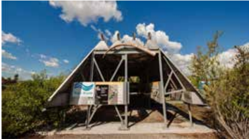
Chino Creek Wetlands and Educational Park (CCP)

Located in the city of Chino, the Chino Creek Wetlands and Educational Park (CCP) provides a hands-on opportunity for the community to experience the importance of constructed wetlands in the protection of our watershed. CCP helps improve water quality, flood control, habitat restoration, water conservation, and provides recreational opportunities for the public. CCP highlights the history of the Chino Valley and the importance of water in our region's economic development with stylized graphs of the hydrologic water cycle, the importance of saving water and public education on how to use water wisely.