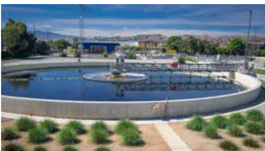
— CCWRF —

Located in the city of Chino, Carbon Canyon Water Recycling Facility (CCWRF) began operation in 1992. The facility works in tandem with RP-2 and serves the cities of Chino, Chino Hills, Montclair, and Upland. The liquids are treated at CCWRF, while the solids removed from the waste flow are treated at RP-2. CCWRF treats an annual average flow of 7.1 mgd.