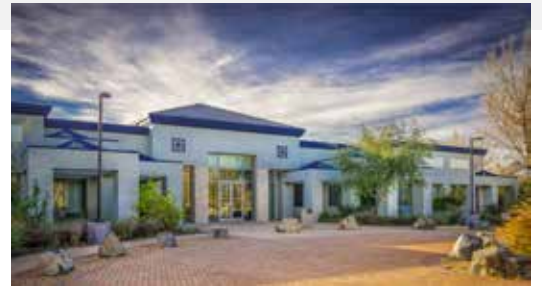
— Administrative Headquarters —

Located in the city of Chino, IEUA is the first public agency in the nation to receive the Platinum rating from the U.S. Green Building Council's Leadership in Energy and Environmental Design (LEED™). Finalized in 2003, IEUA's administrative headquarters takes water and energy conservation to new levels. The extensive use of recycled materials is seen throughout the interior and exterior of the headquarters complex.