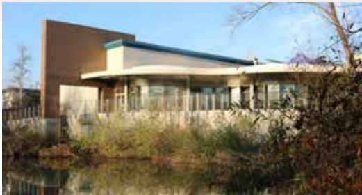
Water Quality Laboratory

Located in the city of Chino, IEUA's Water Quality Laboratory manages water quality testing, enhances performance and improves the process of sample analysis. Built in 2018, the laboratory received the Gold rating from the U.S. Green Building Council's Leadership in Energy and Environmental Design (LEED™). The Laboratory supports the analytical needs of IEUA's five wastewater reclamation plants and the Groundwater Recharge Program with approximately 18,000 samples collected and 64,000 tests conducted each year.