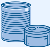
Aluminum food cans