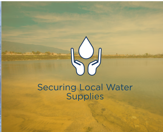
Securing Local Water Supplies