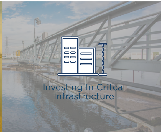
Investing In Critical Infrastructure