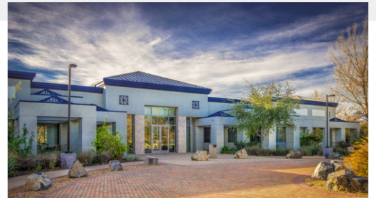
— Administrative Headquarters —

Located in the city of Chino, IEUA is the first public agency in the nation to receive the Platinum rating from the U.S. Green Building Council's Leadership in Energy and Environmental Design (LEED™). Finalized in 2003, IEUA's administrative headquarters takes water and energy conservation to new levels. The extensive use of recycled materials is seen throughout the interior and exterior of the headquarters complex.