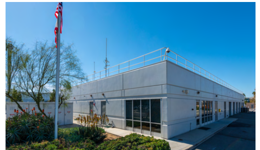
Chino Basin 1 Desalter

The Chino Basin Desalter Authority (CDA) was formed under a Joint Exercise of Powers Agreement by local agencies, including: cities of Chino, Chino Hills, Norco, and Ontario, IEUA, Jurupa Community Services District, Santa Ana River Water Company, and Western Municipal Water District. Located in the city of Chino, IEUA operates the Chino 1 Desalter which uses reverse osmosis technology to remove salt and nitrates from groundwater pumped from 14 wells throughout the Chino Basin. It produces 10.9 mgd of high-quality drinking water, serving the water needs of approximately 35,000 people.