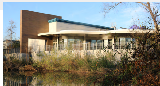
Water Quality Laboratory

Located in the city of Chino, IEUA's Water Quality Laboratory manages water quality testing, enhances performance and improves the process of sample analysis. Built in 2018, the laboratory received the Gold rating from the U.S. Green Building Council's Leadership in Energy and Environmental Design (LEED™). The Laboratory supports the analytical needs of IEUA's five wastewater reclamation plants and the Groundwater Recharge Program with approximately 18,000 samples collected and 64,000 tests conducted each year.