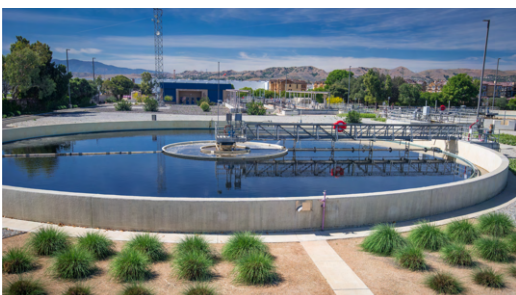
— CCWRF —

Located in the city of Chino, Carbon Canyon Water Recycling Facility (CCWRF) began operation in 1992. The facility works in tandem with RP-2 and serves the cities of Chino, Chino Hills, Montclair, and Upland. The liquids are treated at CCWRF, while the solids removed from the waste flow are treated at RP-2. CCWRF treats an annual average flow of 7.1 mgd.