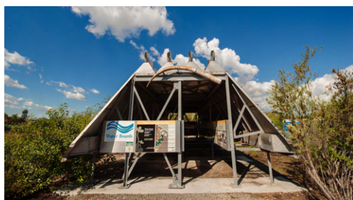
Chino Creek Wetlands and Educational Park (CCP)

Located in the city of Chino, the Chino Creek Wetlands and Educational Park (CCP) provides a hands-on opportunity for the community to experience the importance of constructed wetlands in the protection of our watershed. CCP helps improve water quality, flood control, habitat restoration, water conservation, and provides recreational opportunities for the public. CCP highlights the history of the Chino Valley and the importance of water in our region's economic development with stylized graphs of the hydrologic water cycle, the importance of saving water and public education on how to use water wisely.