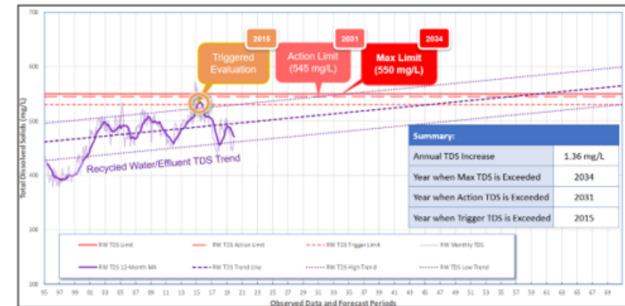
Figure 13: Recycled Water Statistical Model Trend Envelop Results

The analyses demonstrate increasing trends in TDS concentrations for the water supply and recycled water. Based on the analysis, the recycled water trend envelop has an average increase of 1.36 mg/L per year. IEUA's internal Trigger Limit (530 mg/L) was reached in 2015 and, based on the trends, the statistical model forecasts exceedance of the RWQCB TDS Action Limit (545 mg/L) and Maximum Limit (550 mg/L) within the next 11 to 14 years, respectively (Figure 13).