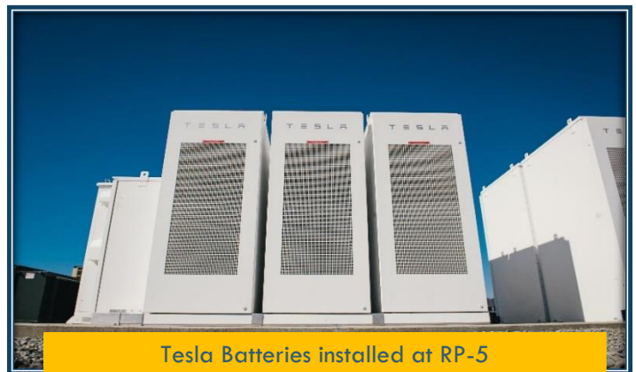
Tesla Batteries installed at RP-5

IEUA is committed to optimizing facility energy use and effectively managing renewable resources to achieve peak power independence and contain future energy costs.