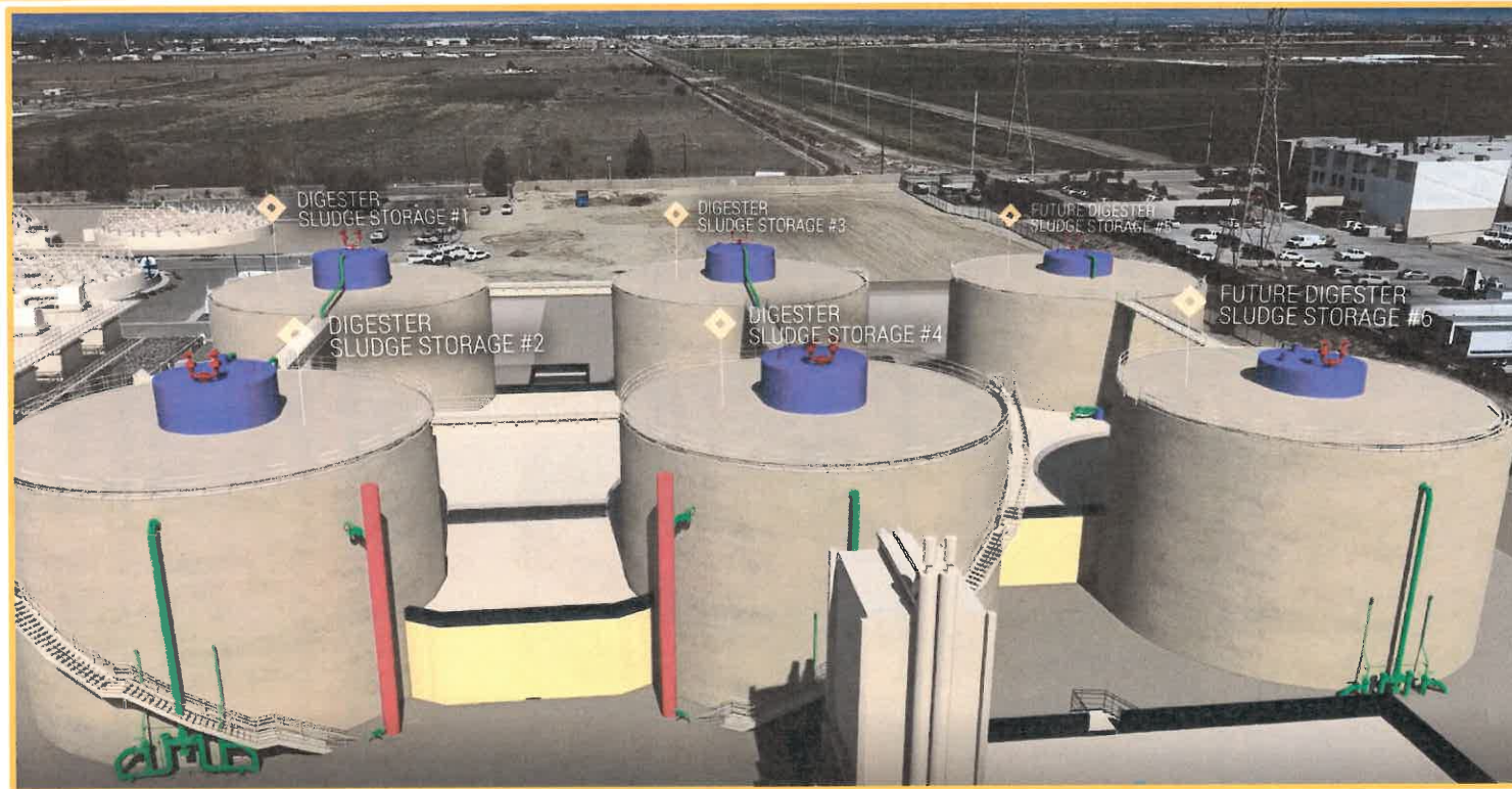
RP-5 Solids Video