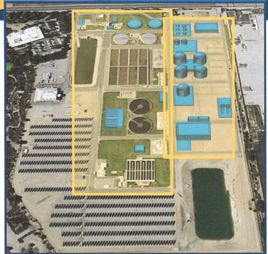
RP-5 Liquids Treatment Expansion & Solids Treatment Facility During Preliminary Design