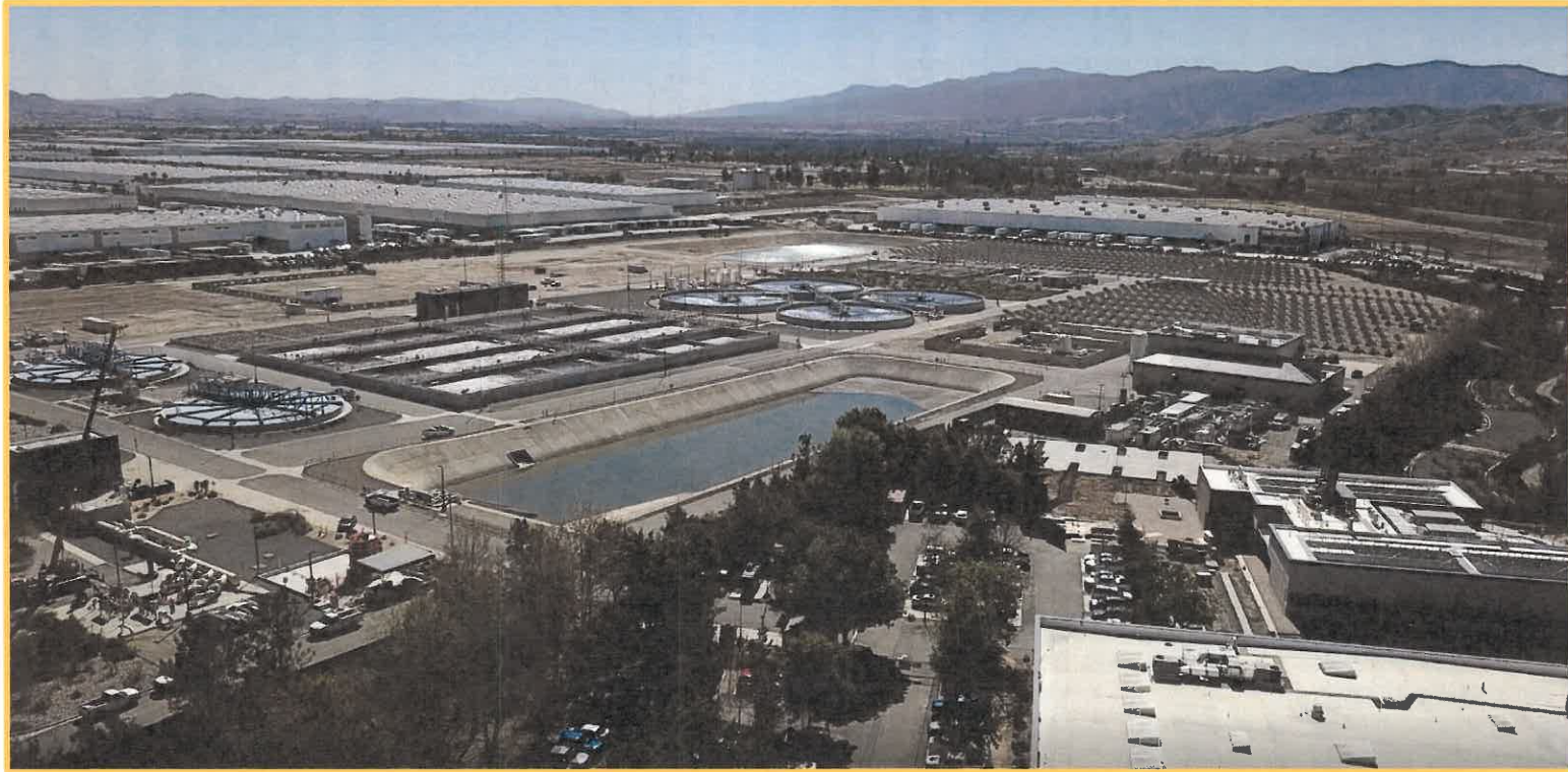
RP-5 Liquids Video