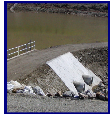
Berm Hardening at Declez Basin