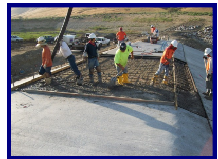
Construction Concrete Spillway at Declez