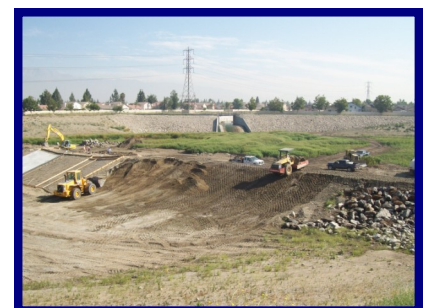
Construction of Berm No. 1 at Declez