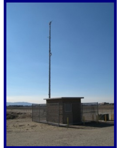
Proposed Communication Tower