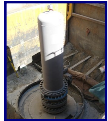
Valve installed at CB-14