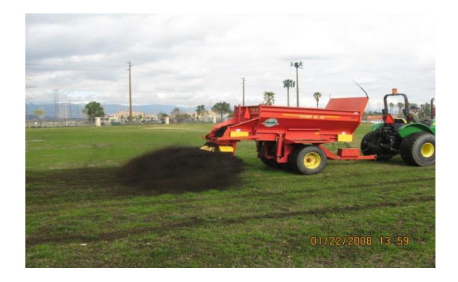
SoilPro compost applied to soccer field

The US Composting Council awards program recognizes outstanding achievements in the organics recycling and composting industry. The Composter of the Year Award is awarded to a commercial-scale composting facility, public or private, which has displayed excellence in both compost production and marketing/distribution. The nominated facility must be in operation for a minimum of 5 years, process more than 10,000 tons of feedstock per year and be in regulatory compliance for the last 3 years. 2012 was the first year the IERCA was eligible for the award after passing its 5 year anniversary. The IERCF processes more than 200,000 tons of recycled products per year creating high-quality compost.