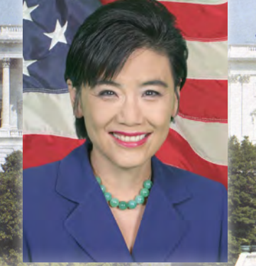
irrigation. By using recycled water at our schools and parks we can stretch our existing water supplies helping to drought-proof our region".