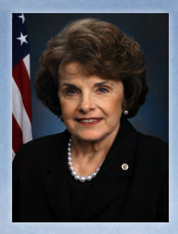
"Recycled water is a critical part of California's water future. It provides our state and region with the ability to 'stretch' existing water supplies significantly." Dianne Feinstein U.S. Senator