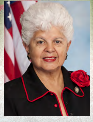
"Continued water conservation is crucial to the long term economic future of our communities - businesses cannot prosper without a secure supply of water. It is also the key to avoiding costly customer rate increases. We must educate people on how to conserve water at home landscaping with native plants, fixing leaks, and watering your lawn only when it needs it. Every drop is precious for all."

Grace Napolitano U.S. Congress 32nd District