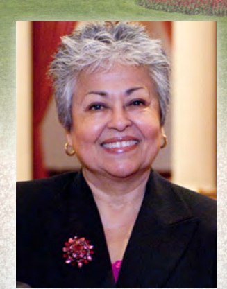
"A clean water supply is essential for the health and safety of the inland empire's growing population. The IEUA Recycle Water Program encourages maximum use of recycled water for beneficial purposes, thereby conserving water within the Chino Basin and surrounding areas."

Grace Napolitano U.S. Congress 32nd District