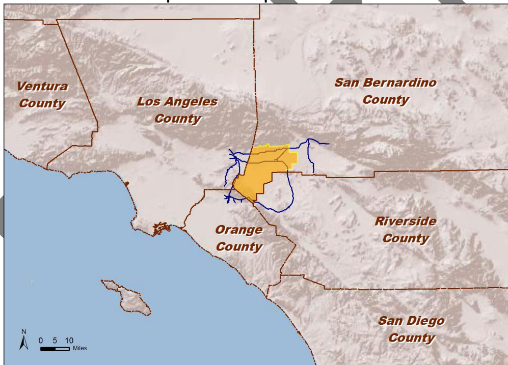
Figure 1-1 Location Map of Inland Empire Utilities Service Area

The Santa Ana Watershed is the fastest growing area in the United States (current population of 5.3 million is projected to increase by 2 million over the next 25 years). Rapid urban growth will require careful water resources planning and management to ensure adequate water supplies and address water quality management problems.